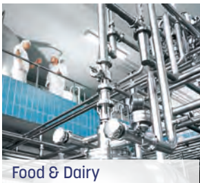
Food & Dairy