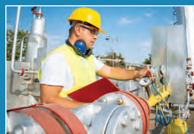
Commissioning & Maintenance