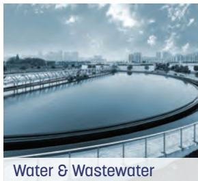
Water & Wastewater